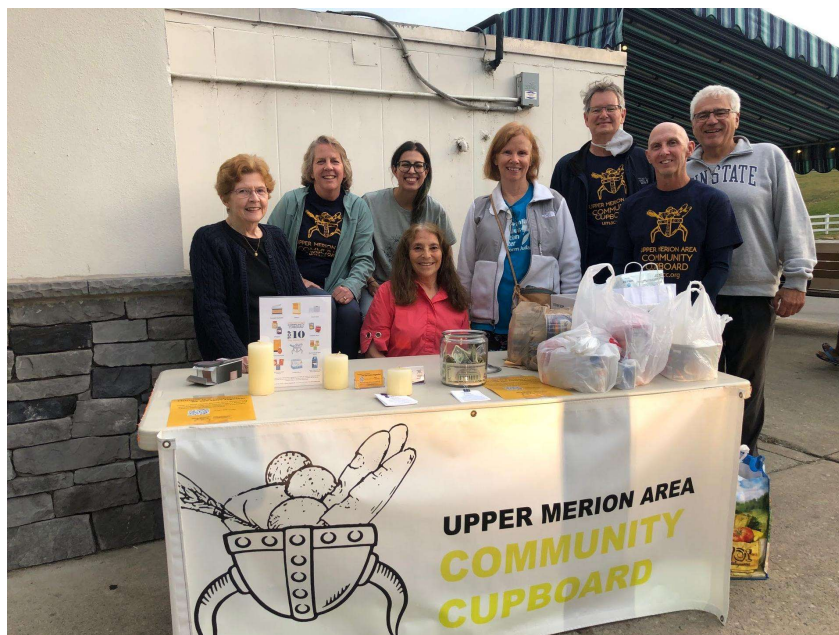
Volunteers representing UMACC at a Petrucci's fundraiser.

We were able to increase our community presence this year by organizing multiple fundraiser events and attending dozens of community-run events such as the farmers' market.