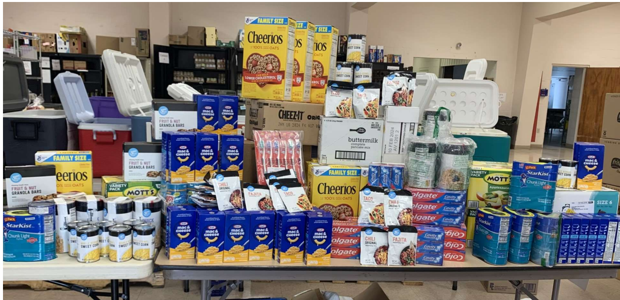
Items donated through our Amazon Wishlist.